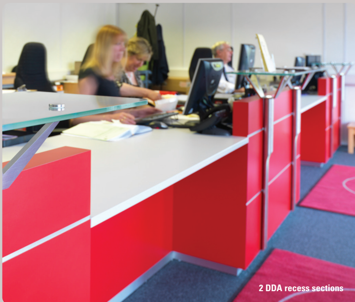
2 DDA recess sections

To enjoy the same ease, efficiency and reliability with your next project call the Clarke Rendall sales support team today on 01908 391600 .