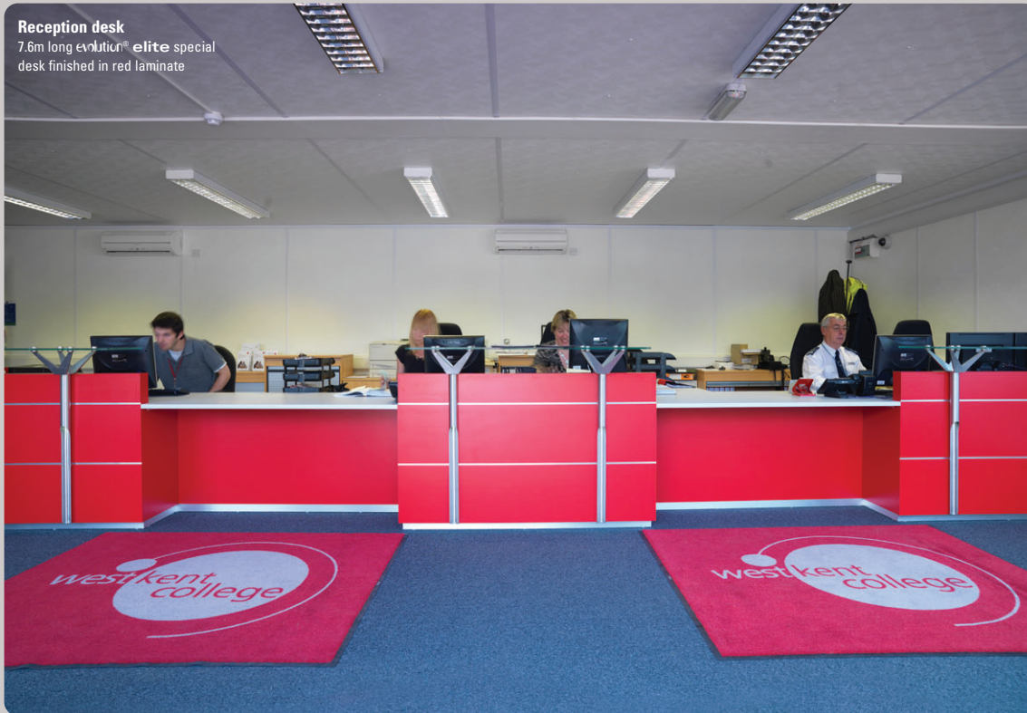
Reception desk 7.6m long evolution® elite special desk finished in red laminate

"This was a huge desk, and I'm very pleased with how the project went. What I like about dealing with Clarke Rendall is that they do exactly as they are asked. If ask for a quote - I get a quote, If I tell them I'm in a hurry, I get it quickly"