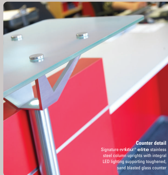
Counter detail Signature evolution® elite stainless steel column uprights with integral LED lighting supporting toughened, sand blasted glass counter